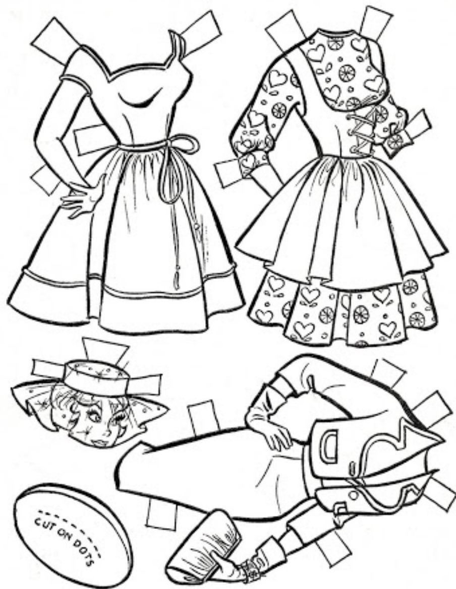
DRESSES FOR TERRY