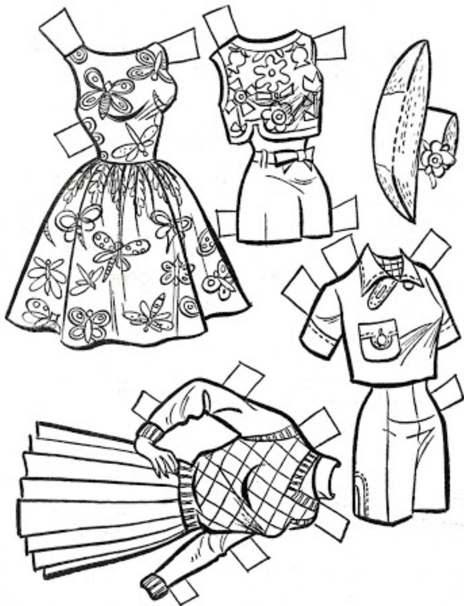
HONEYMOON CLOTHES FOR TERRY